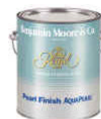
310 Regal AQUAPEARL PEARL FINISH

Don't forget Quality Benjamin Moore & Co. brushes and rollers to complete the project.