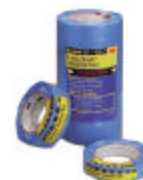
3M Brand Blue Painter's Masking Tape