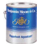
319 Regal AQUAVELVET EGG SHELL FINISH